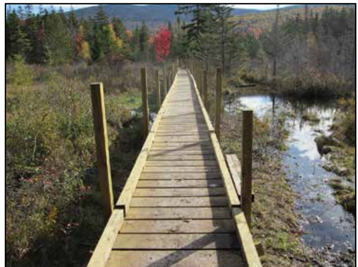
Zealand Trail Oct 2, 2012