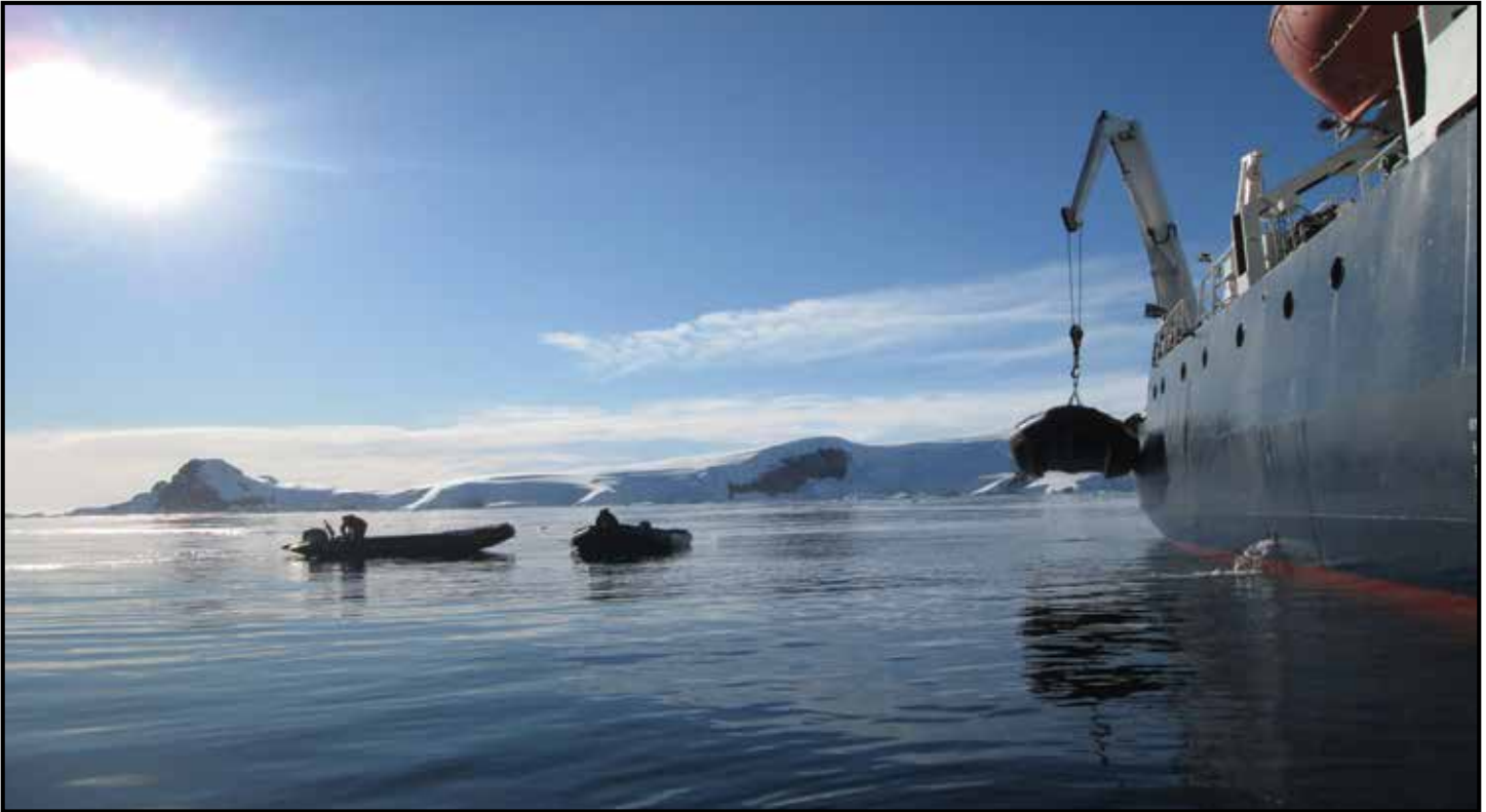
Zodiacs launching from the Polar Pioneer in Curtiss Bay, Antarctic Peninsula