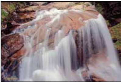
Avalanche Falls at 1/15th second

Photographing waterfalls and flowing water is all about using various shutter speeds to control the amount of motion blur. In general, faster shutter speeds are used to stop the flow, capture the spray, and add some excitement. Slower shutter speeds capture the flow lines and impart a more pastoral calm effect. Very slow shutter speeds result in a shapeless 'cotton ball' surreal effect.