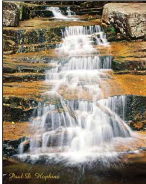
Bemis Cascades at 1/2 second

ISO sensitivity, and a small f-stop, (f/11, 16, or 22).