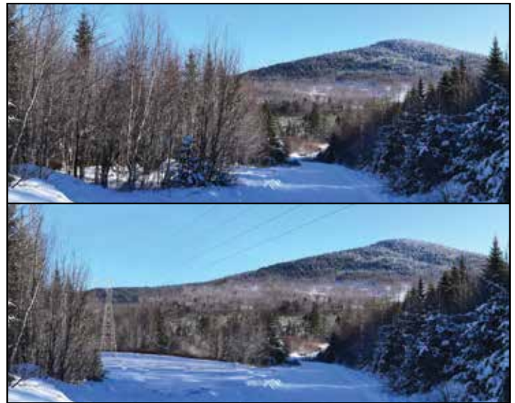
View from Signal Mtn Rd in Millsfield, NH, showing proposed changes, resulting in high aesthetic impact.

[Northern Pass] has failed to take best practical measures to avoid, minimize and mitigate these impacts. In particular, the applicant has failed to utilize an alternate route that would avoid these impacts in their entirety.