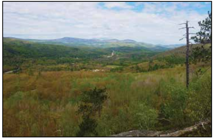
View from the Final Frontier.

“Thanks to the remarkable support of the Rumney climb-