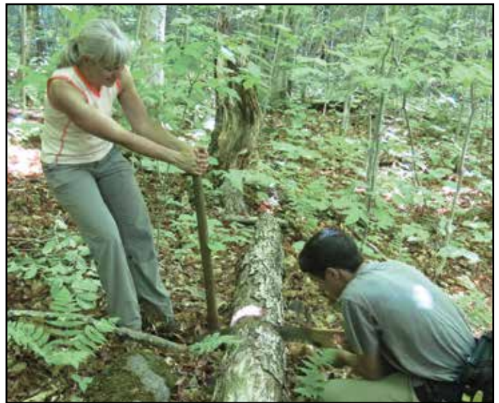
Family work.