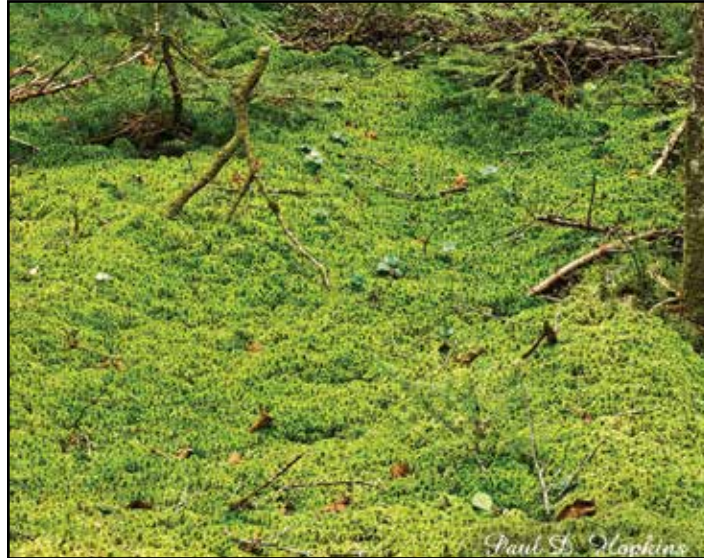
Typical moss bed.

Working my way up, I began to notice the trailside awash in an emerald-green carpet of sphagnum moss. I observed that, with each step, I was leaving the forest hardwoods of beech, oak, and maple behind, replaced with higher-elevation red spruce and balsam fir. I paused to listen, not only to the sound of my wheezing lungs and thumping chest,