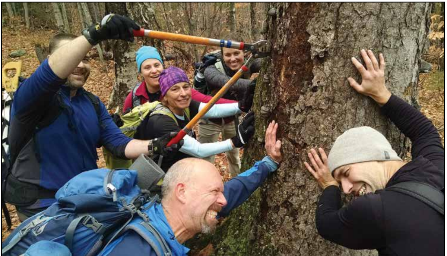
It takes a crew to fell a tree.