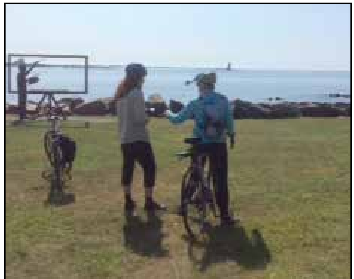
Two riders in the AMC Gene Harding Memorial Ride in New Castle, NH.

Are you tired of the same old routes you always ride? Check our activities page to see where we are offering rides in areas which may be new to you throughout the state. http://amc-nh.org/calendar/activities