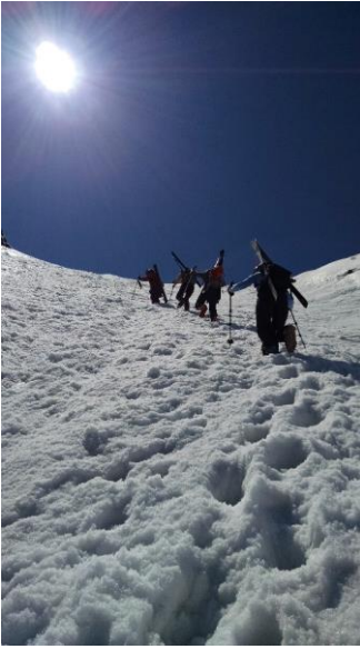
Ski committee booting up Left Gully, Tuckerman ravine, April 2017.