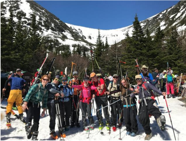
End of year party: the group at HoJo on the way up to Tuckerman ravine. April 2017.

In addition to the above, the ski committee also offered three classes at each of the two NH-AMC winter schools at Cardigan lodge: Intro to BC skiing, Intermediated BC skiing and Downmountain skiing.