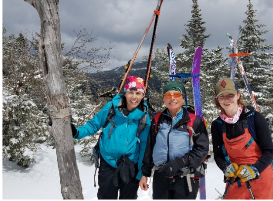
Summiting the ridgeline after climbing a steep gully on Big Jay, April 2018.