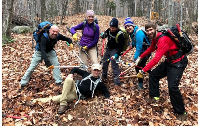
Ski trail work day at Cardigan, November 2017. Esprit de corps trimming a crew leader's hair.