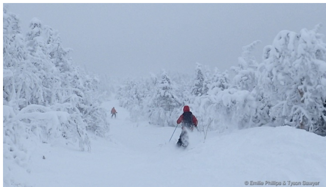
Skiing the Cog Railway, February 2018.