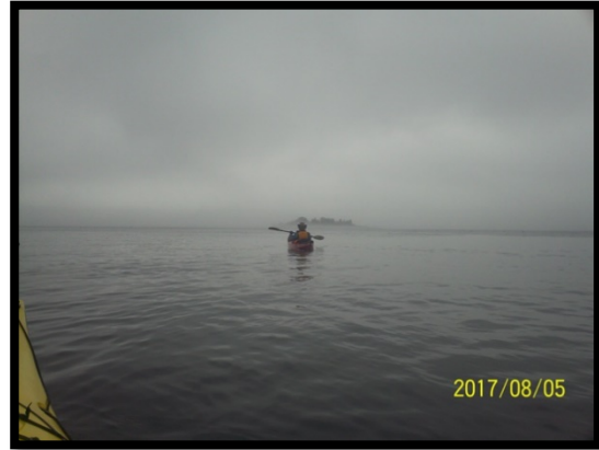
Knubble Bay kayaking 2017