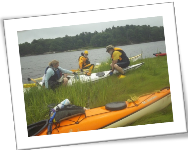
White Water School 2018

Knubble Bay Training and Kayaking weekend had 16 attendees this year. The weekend is for new kayakers (Level 1), to learn the skills needed for self and assisted rescue, paddle strokes, basic navigation and day paddle planning. We also welcome seasoned kayakers to join us to perfect their skills.