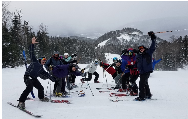
Leaders' early season Telemark clinic at Loon Mountain, NH, December 2017.