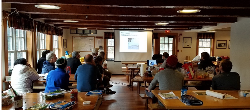
Ski leader training day, Cardigan Lodge, November 2017.

The ski committee gifted the active leaders with a neck buff (gaiter) with the ski committee logo on it. The goal is to encourage the current leaders to develop their skill development as trip leaders, as skiers, and as outdoorspeople.