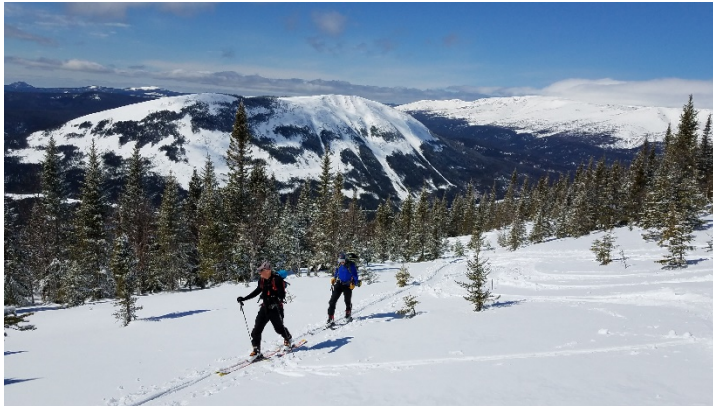
Climbing the snowfields on Blanche La Montagne, with Hogsback in the background, Chic-Choc National Park, Gaspé, QC, Canada, March 2018.